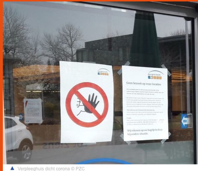
▲ Verpleeghuis dicht corona

In the southern part of the Netherlands, organizations closed from March 10 th