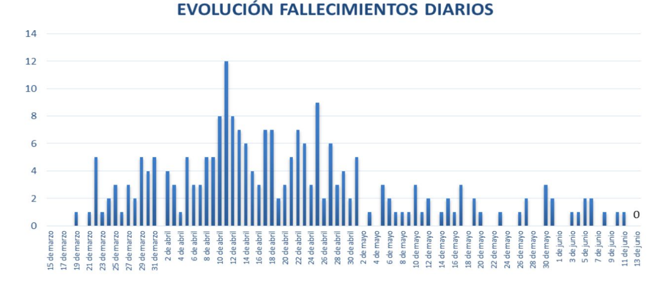
Figure 2. Daily number of deaths in care homes in Asturias, 15<sup>th</sup> March to 13<sup>th</sup> June